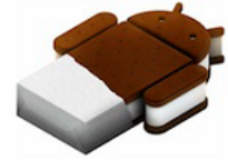
Ice Cream Sandwich Android 4.0