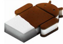
Ice Cream Sandwich Android 4.0