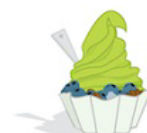
Froyo Android 2.2